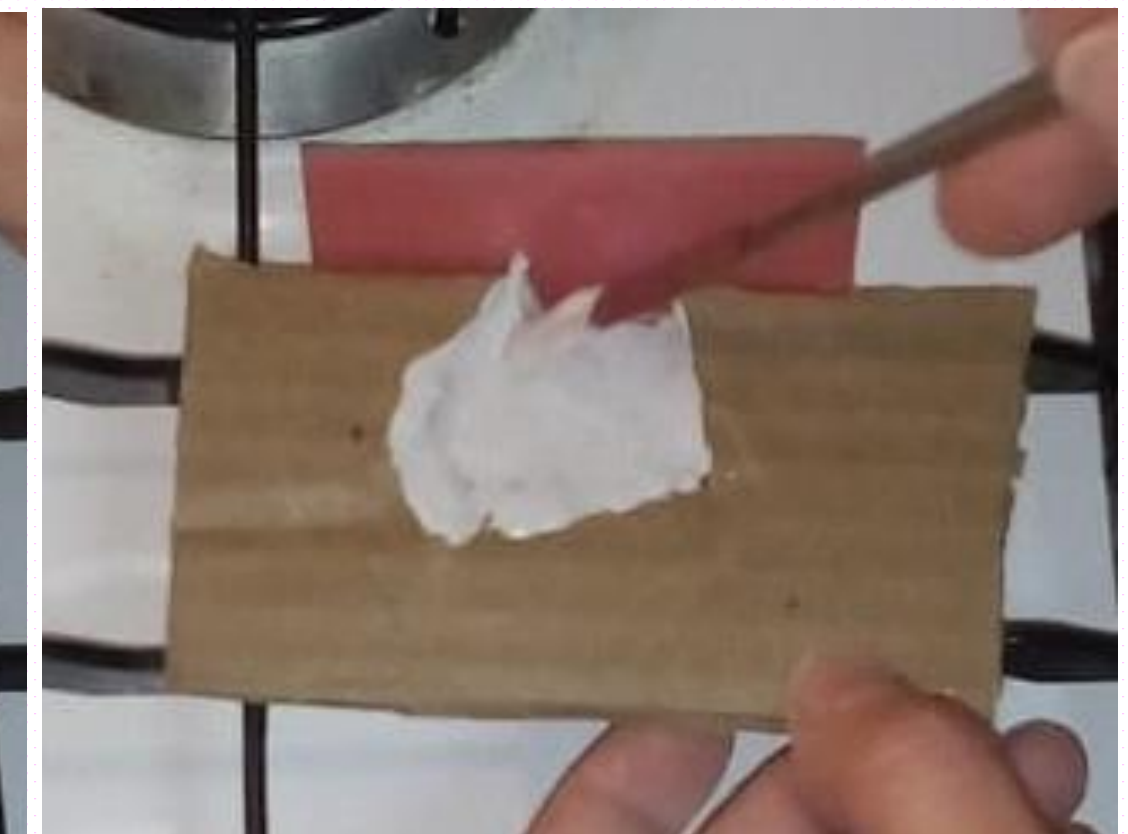
Figures. Dots technique. It was not possible to photograph at the time of the work. Therefore, on these images are shown a recreation of the technique using a piece of cardboard simulating the bone.