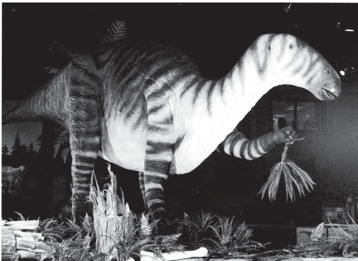
Figure 2. An Iguanodon considering lunch.

sponsorship had been given by local ferry operator, Wightlink!