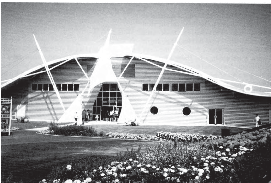
Figure 1. View of the Dinosaur Isle complex.

Mind you, as a local, I think I would be a bit miffed to swop a free museum for a paying attraction. Especially after having paid for it already through my Council Tax and after the Millennium Commission had given grant aid to the tune of £1.3m and